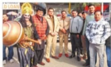
An artist dressed as 'Yamraj', along with police officials and residents, in Yamunanagar.

The Yamunanagar district police has launched a traffic awareness campaign as part of Road Safety Month. Under this campaign, an artist dressed as 'Yamraj' educated drivers and the general public about the importance of following traffic rules. The symbolic portrayal of Yamraj became a major attraction for the public and helped draw attention to road safety messages. Police spokesperson