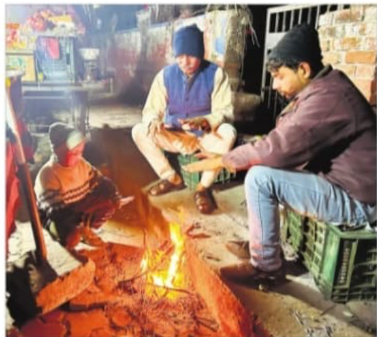
Locals sit around a bonfire in Rohtak on Tuesday.

Appealing to the public, Swachh urged citizens not to engage in illegal activities that increased environmental pollution and endangered public life. He emphasised that ensuring a clean, safe and pollution-free environment was the priority of the administration and required cooperation from all sections of society.