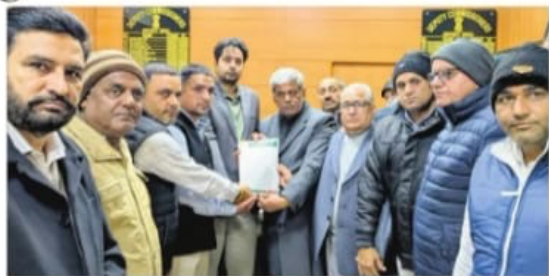
JJP leaders submit a memorandum to the Deputy Commissioner in Sirsa on Tuesday.

The memorandum also questioned the selection of a public sector undertaking to prepare the results, despite its lack of prior experience in handling such exams. It pointed out that while the initial results were prepared in just