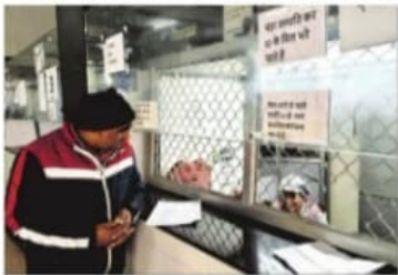
Property tax collection underway at the MC office in Rohtak.