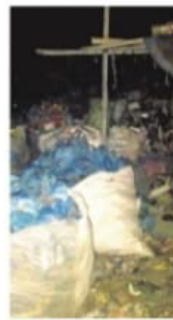
Plastic waste dumped at a site in Chhotu Ram Nagar of Bahadurgarh town.

During the inspection, it was found that plastic waste was being illegally dumped in several plots in violation of prescribed norms. Acting on the spot, the SDM directed officials to seal three such plots and impound four vehicles that were being used for