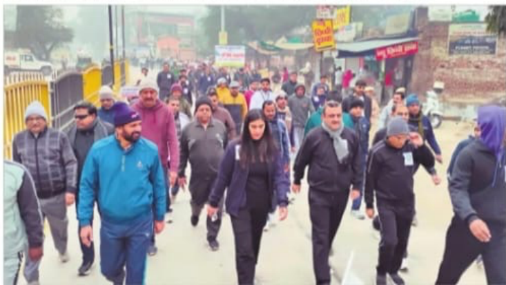
Judicial officers, district administration officials and residents participate in a walkathon at Narnaul on Tuesday.