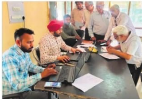
Karnal Municipal Corporation officials interact with public during a camp. FILE PHOTO

Move aimed at improving work efficiency, strengthening office discipline