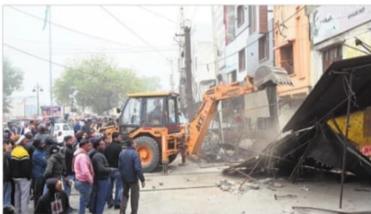
Municipal Corporation officials remove encroachments at Rajguru market in Hisar.