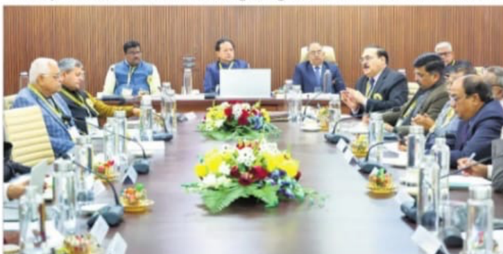
Vice-Chancellors and officials of universities engage in discussions during a conference.

Two-day national conference at HAU to strengthen agricultural education & research concludes