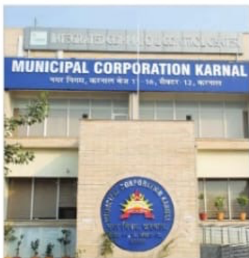
The Karnal Municipal Corporation office.

Apart from these adopted MCs, the KMC focuses on Indri, Tharori, Nissing,